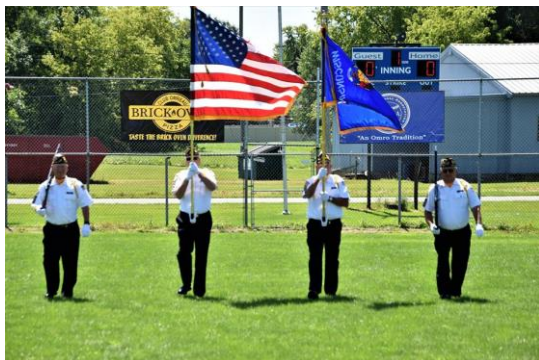
Presenting Colors at OASA Old Timers Game