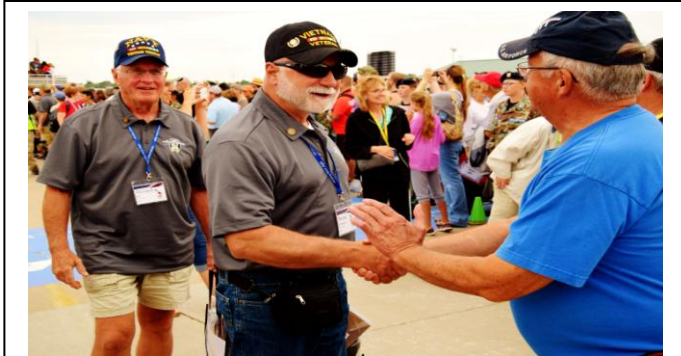
Welcome Home! EAA Honor Flight