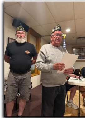
The two Dean's handing out Certificates of Recognition to attending members of the Honor Guard.