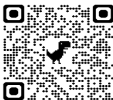
Post 234 Facebook