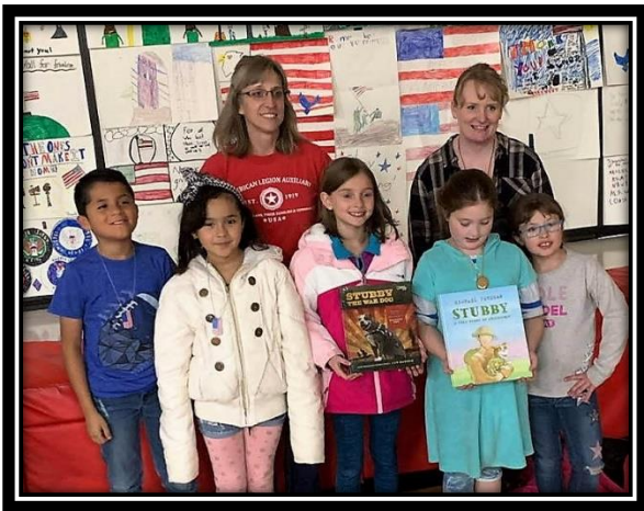
In Honor of Veterans Day, The Omro American Legion Family Proudly Presented: "SGT. STUBBY, AN AMERICAN HERO" the movie at Omro Elementary. Books were donated to HB Patch and Omro Elementary by ALA Unit 234, Omro.