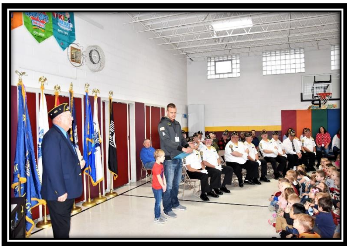
VETERANS DAY IN OMRO HB Patch School Veterans Memorial Omro Elementary School